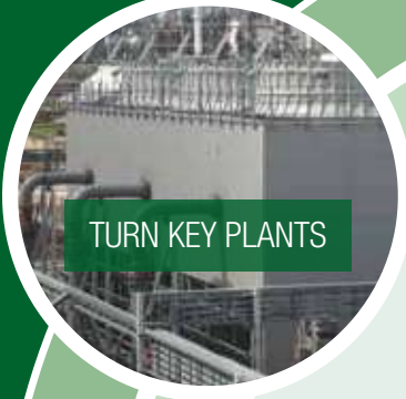
TURN KEY PLANTS