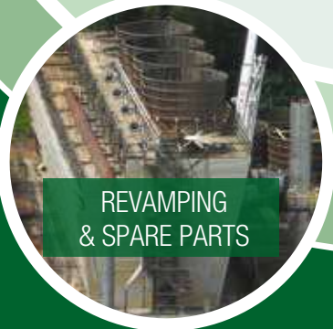
REVAMPING & SPARE PARTS